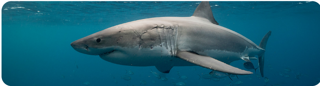
A large great white shark swims just under the surface of the ocean.

Once a shark catches its prey, it uses its many sharp teeth to eat it. Sharks don't have just one row of teeth, like humans do—they have many! When one tooth falls out, another is waiting to replace it.