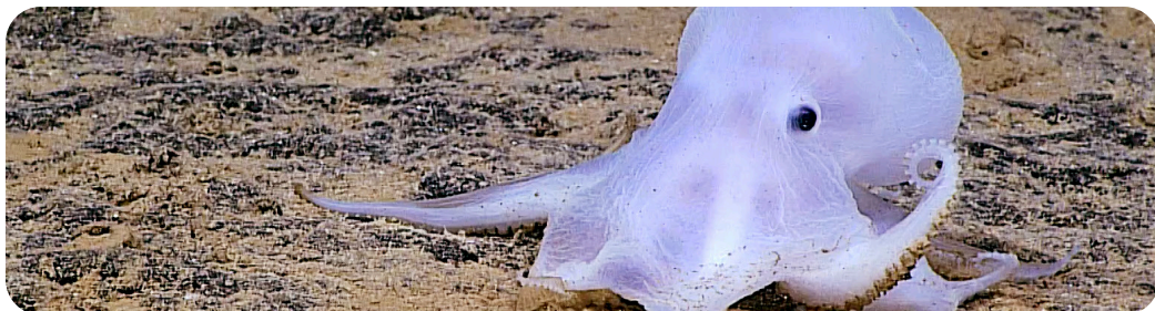
Tiny ghost octopus

The barreleye fish lives in the deep waters of the Pacific Ocean. In the deep sea, there is almost no light from above. The barreleye's giant eyes help it see in the dark. Scientists think that these fish can turn their eyes all around to see food above them or in front of them. They feed on tiny ocean animals called zooplankton. What a frightening sight!