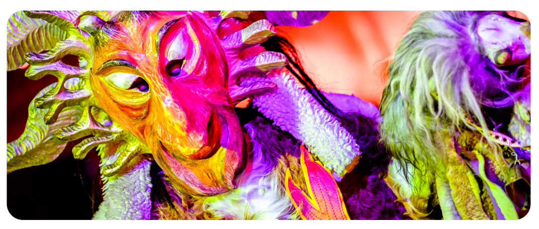
Traditional krampuslauf with costumes and wooden masks.