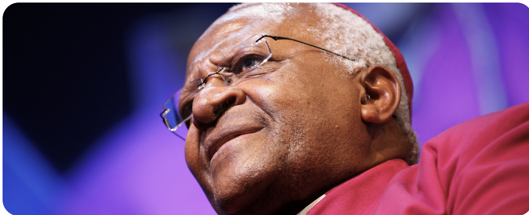
Desmond Tutu, seen in his purple bishop's outfit, became an activist and spoke to millions of people.

Tutu grew up as the son of a teacher. He wanted to learn to be a doctor. However, his family suffered under apartheid, and could not afford to send him to medical school. In 1955, Tutu followed in his father's footsteps and became a high school teacher. But this was just the start of a long journey.