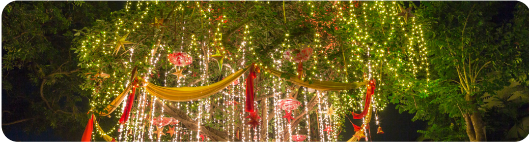
Mango tree decorated for Christmas.

many places. Thousands of miles away in Ukraine, there are plenty of fir and pine trees. However, the way people decorate these trees is unique. In Ukraine, one legend tells the tale of a Christmas spider who helped bring good luck and money to a poor family by spinning her webs over a Christmas tree. The webs then magically turned into gold! Because of this, it is thought to be good luck to have spiderwebs on your Christmas tree in Ukraine. Many people place ornaments designed to look like webs on the tree—or, if they are lucky, a spider might spin a real one!